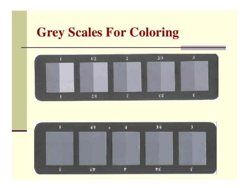
AATCC 169.3 American Standard Test

Manufacturers may also provide a lightfastness in number of sunlight hours. Any number of hours could be given, but outdoor fabrics usually rate anywhere from 500-2000+. The exact number of hours or years a fabric will last without fading is impossible to determine as there are many factors that come into play, such as the type of dye used, fiber content of the fabric, sun intensity and geographical location. Take a moment to consider the difference of the sun's intensity in New York compared to that of New Mexico. Other factors that may affect lightfastness include temperature, humidity, and airflow.